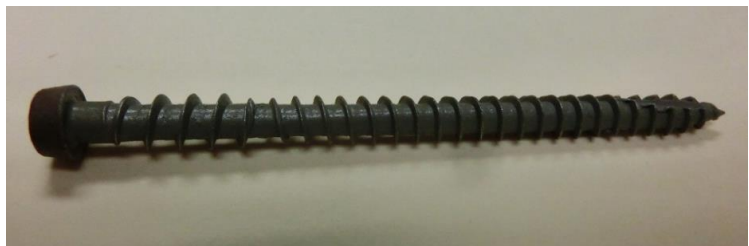
#10 2-3/4" Composite Deck Screw