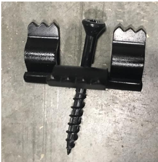
Optima Clip with 1-3/4" Screw

No duration of load increase is allowed for the uplift values noted in Table 1 in this report.